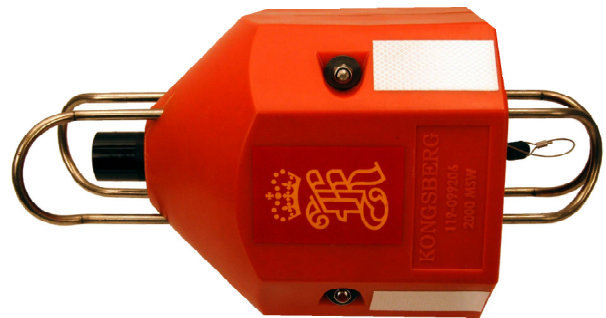
MST 319 w/floating collar

Type no..... 119-099206 Depth rating..... 2000 m Buoyancy: MST 319 / MST 324..... 4.5 kg / 4 kg Height with cage / diameter ..... 549 mm / 275 mm